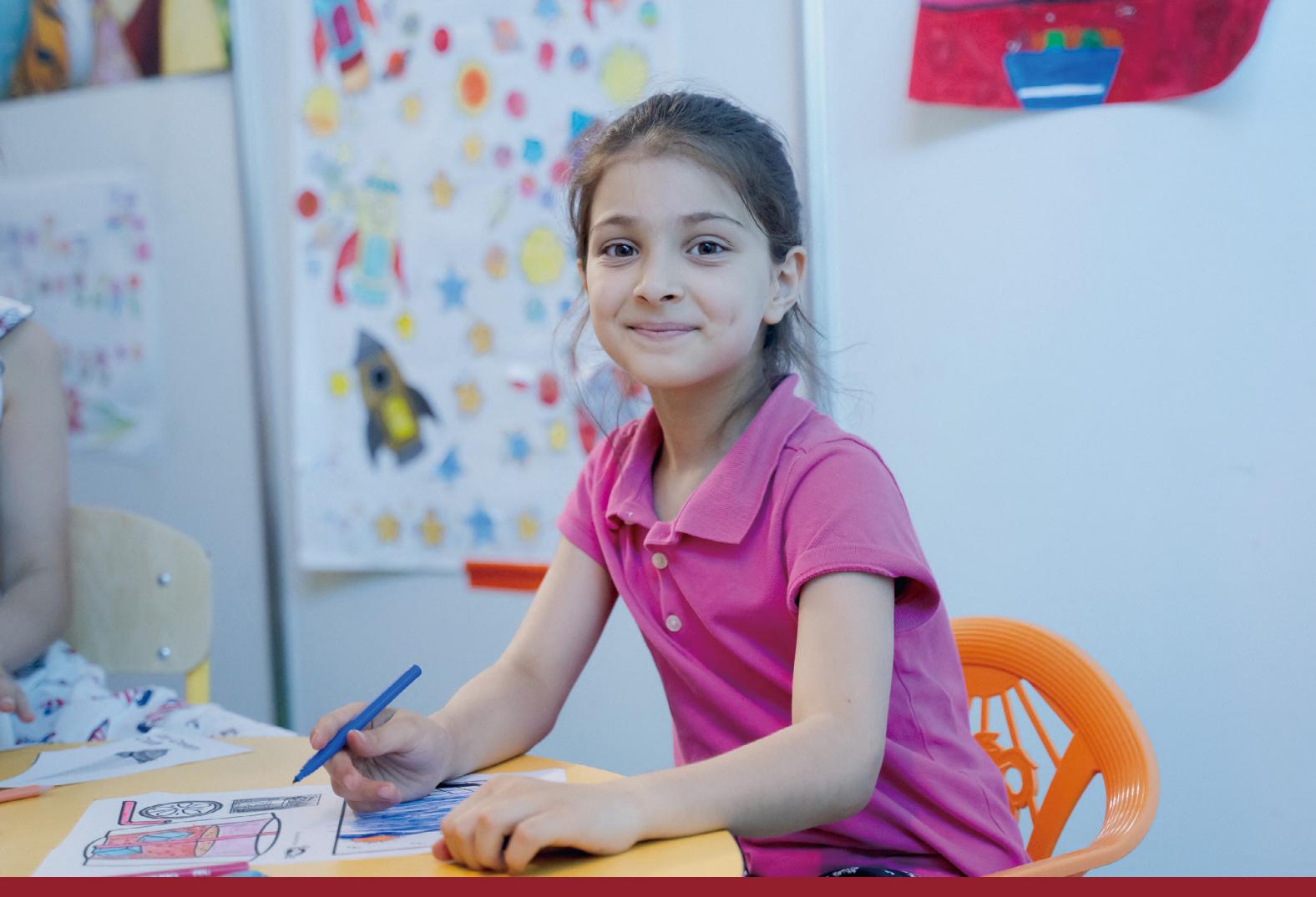
A young refugee girl from Ukraine draws at the Blue Dot center in Chisinau, which is supported by UNICEF Moldova. Here, she was able to make new friends and forget about the trauma of the war.