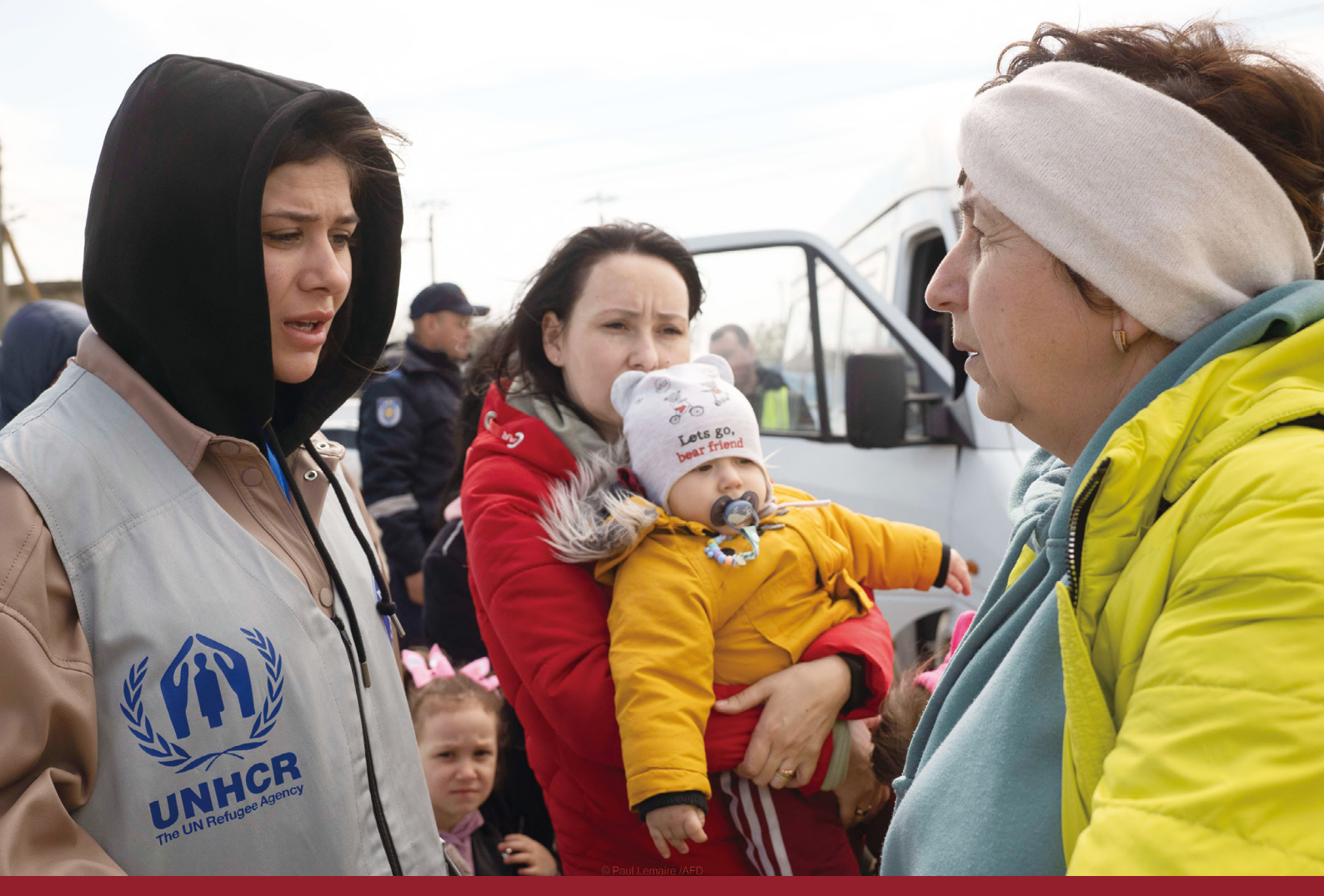
Exchange with Ukrainian refugees as they prepare to board a bus to Chisinau – Moldova, April 14, 2022.