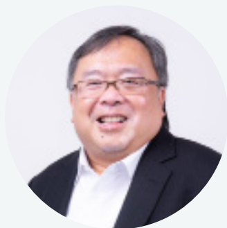
Bambang P. S. Brodjonegoro Professor of Economics, Universitas Indonesia LEAD CO-CHAIR T20 Indonesia

4 The Think20 in 2022 is hosted by Centre of Strategic and International Studies (CSIS) Indonesia and Institute for Economic and Social Research, University of Indonesia (LPEM FEB UI). As one of G20 engagement groups, we strive dialogue of T20 recommendation that is anchored to evidence-based policies focusing on solving global challenges. Global problems from climate change to current health and economic recovery challenges stressing a need of coordinated actions among G20 countries. The global cooperation among countries is accountable when it also reflects consistency in domestic policies and reform that needs to be taken at the country level.