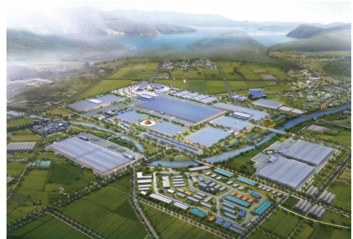
[ Smart farm innovation valley, bird's eye view ]