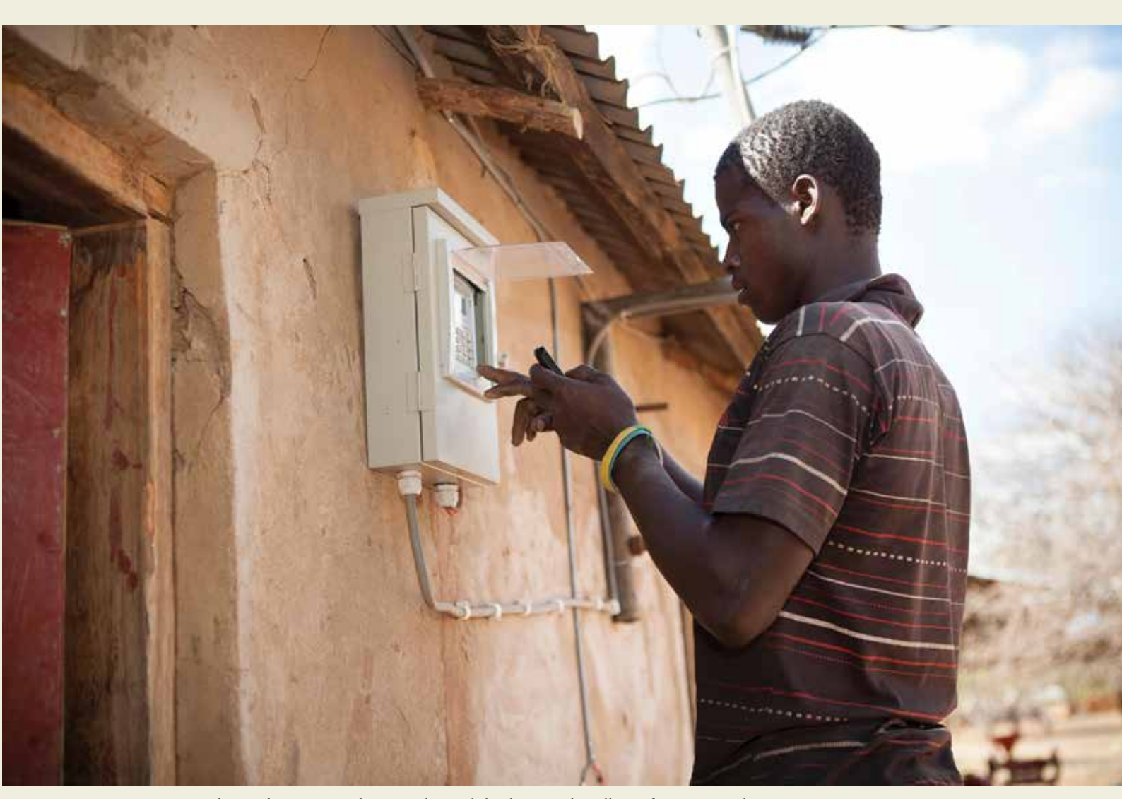
\label{eq:control_problem} A \ \text{man purchases electricity credits using his mobile phone in the village of Hogoro, Dodoma Region, Tanzania.} \ Photo \ by \ Jake \ Lyell/Alamy