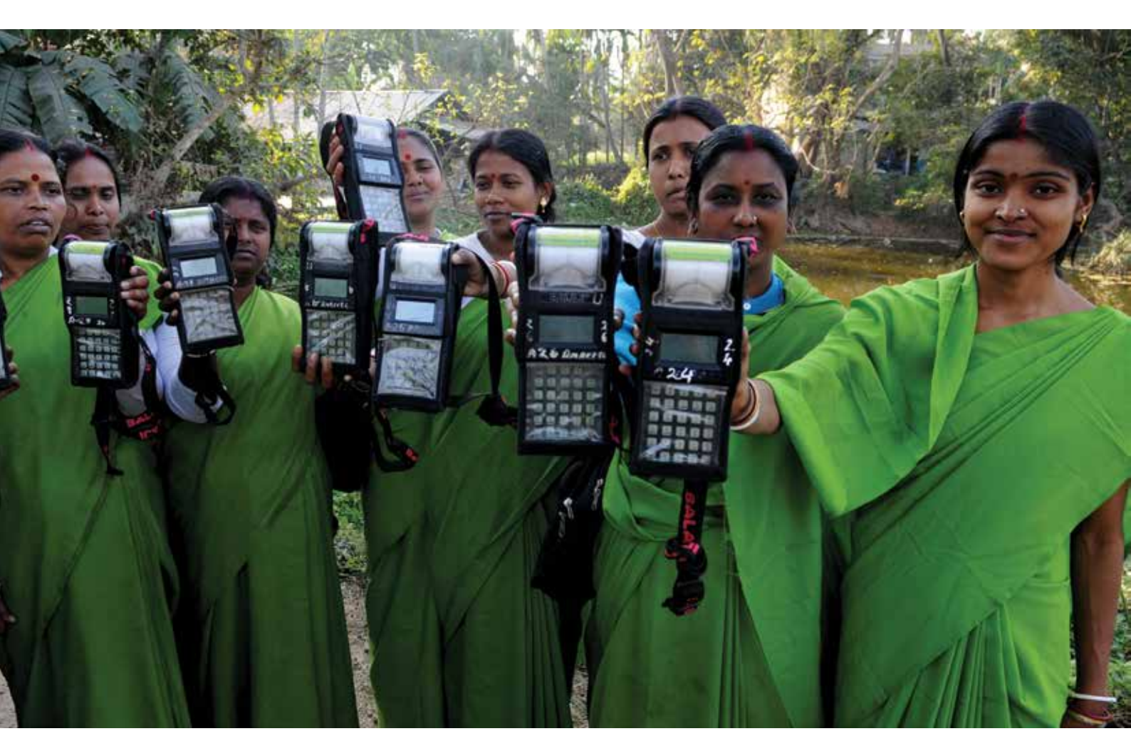
Women agents of a microcredit institution show their daily collection which is recorded in an electronic device.