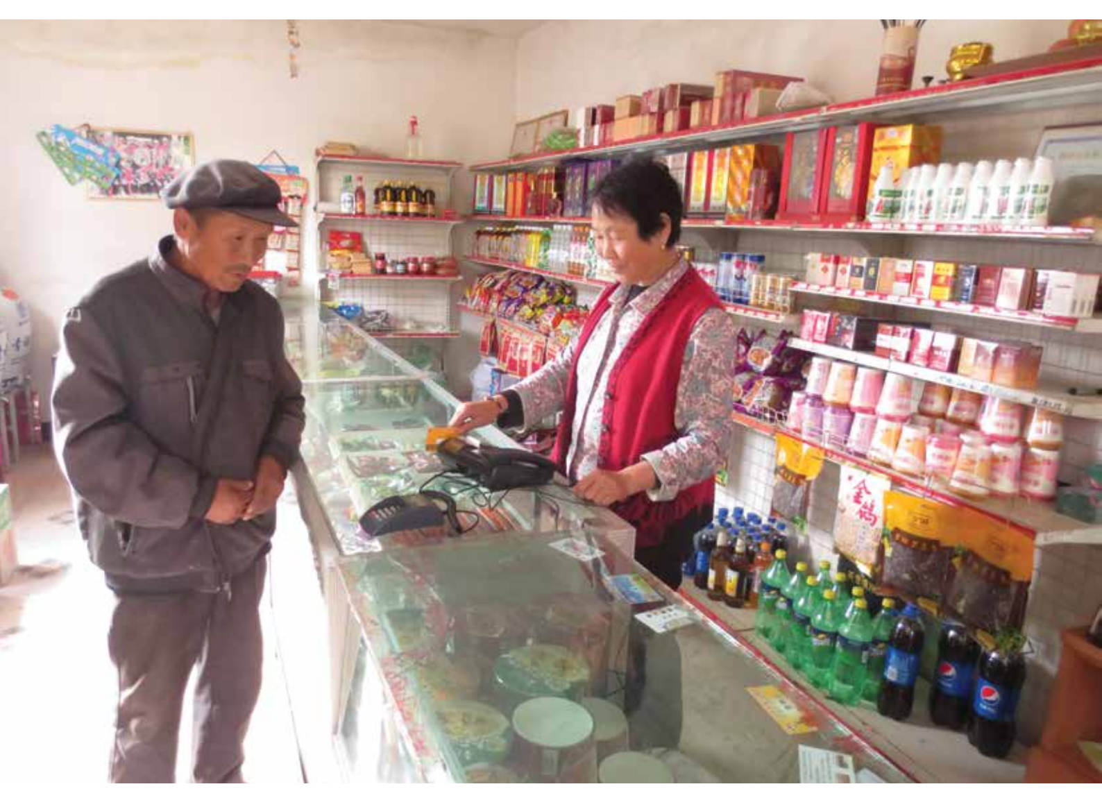
A farmer uses a digital money transfer service in Qinghai Province, China.