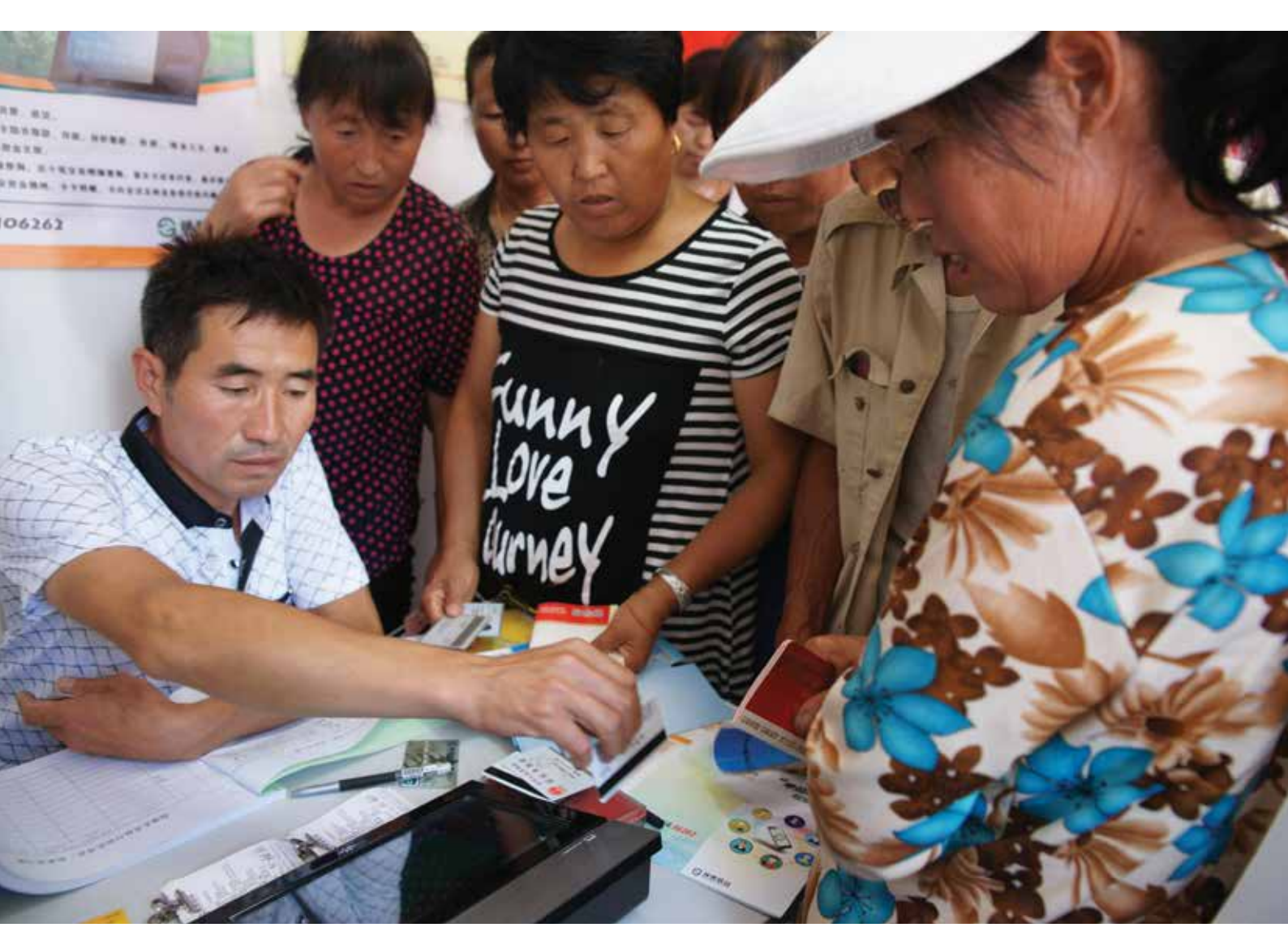
Women using a bank agent with a digital payment service in the rural area of Shaanxi Province, China.