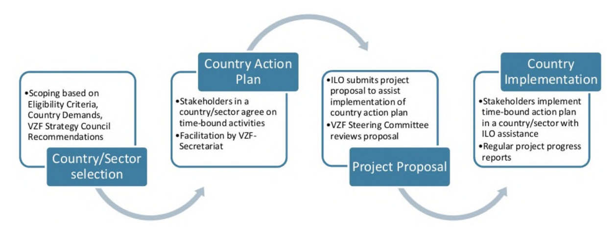
Figure 2: VZF Project Implementation